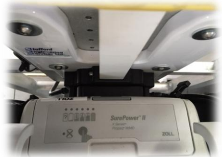
Compact 245mm Total

Part Number SES / ED001 Easy-Doc Wall mounted Bracket with Power