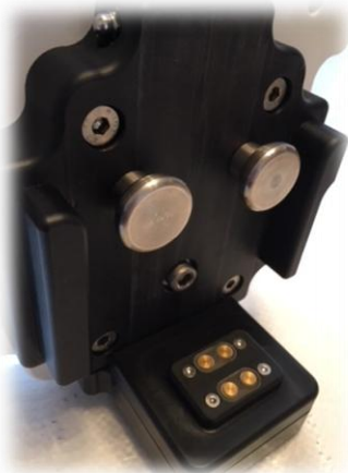
Charging Dock for Automatic Charge